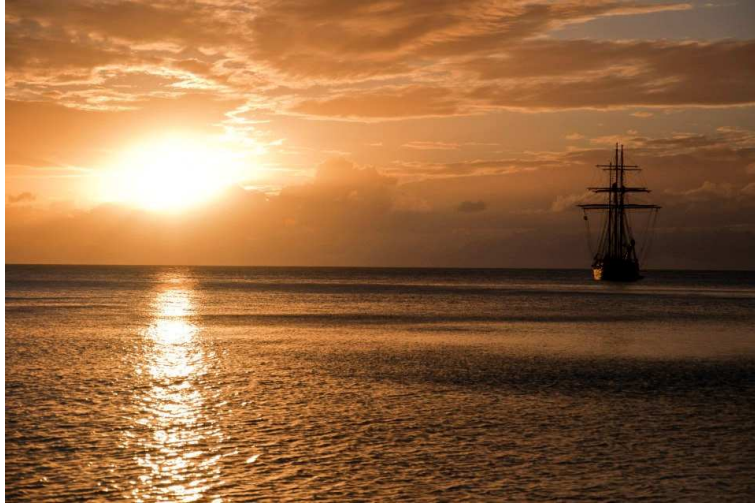
From the Source to the Sea

Water is a sacred gift, fundamental and indispensable for sustaining all life. It's the life-giving fluid of our planet needed by all organisms, humans, animals, and plants alike. Our very existence is intimately connected with - - and dependent upon - - the quality of water.